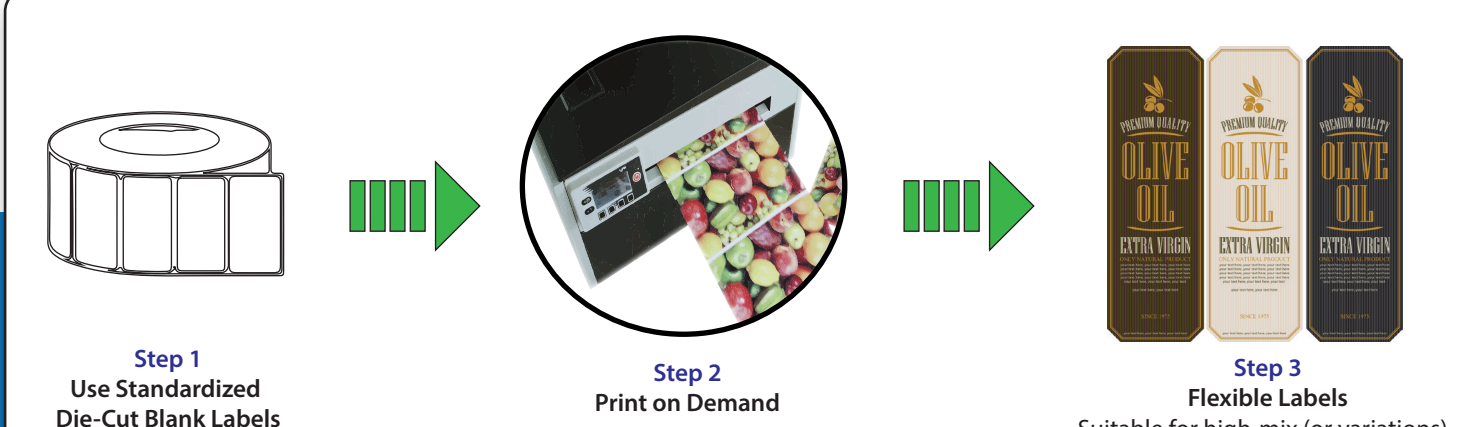
Flexible Labels Suitable for high-mix (or variations), low volume production